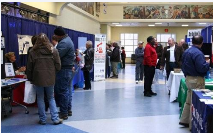
PHOTO ALBUM: 2010 Family Financial Fair and Stark County Saves Week

Click here for a list of previous Gold Key winners.