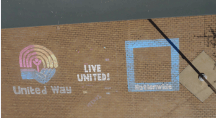
Roof top view of walkway artwork at Nationwide facility

"Talk Like A Pirate" day. Their campaign increased more than 12% from last year.